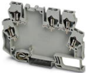
Housing fully equipped, with marker groove and additional PE contact, 5-pos., color: gray

Please be informed that the data shown in this PDF Document is generated from our Online Catalog. Please find the complete data in the user's documentation. Our General Terms of Use for Downloads are valid ( http://phoenixcontact.com/download )